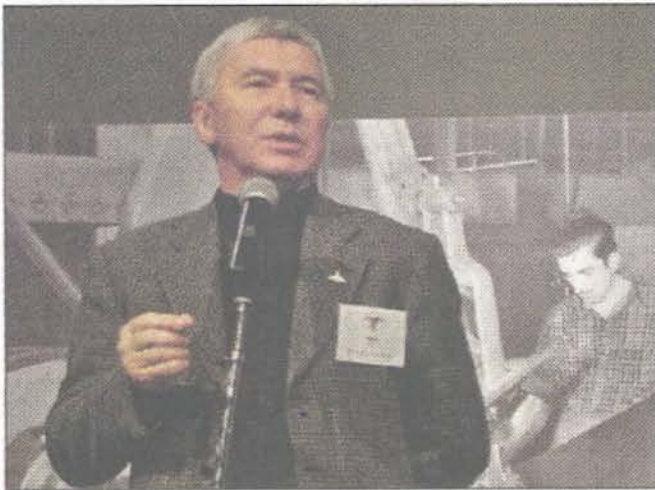
Kitchener Mayor Carl Zehr had welcoming words for everybody and is enthusiastic about the future of Downtown